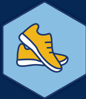
PROP B ATHLETICS & RECREATION