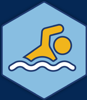
PROP A AQUATIC CENTERS

What's on the May 4 Ballot for LISD Voters?