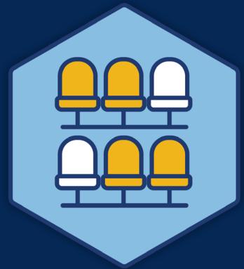
PROP C STADIUMS