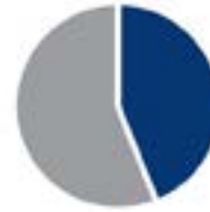
PSAT/NMSQT Reading/Writing 40.1%