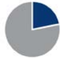
PSAT/NMSQT Math 22.2%