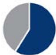
SAT Reading/Writing 59%

Percent of students whose test scores indicate they are college and career ready.