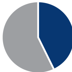
PSAT Reading 43%