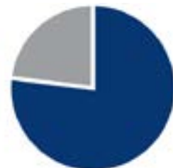
Pre AP/AP enrolled 77%