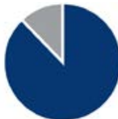
PSAT Reading 88%

Percent of students whose PSAT test scores indicate they are college and career ready. Percent of student population who are enrolled in at least one advanced course.